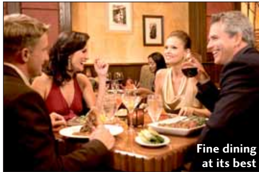
Fine dining at its best

The carving stations at both buffets offer hand sliced roast beef, braised turkey breast, and slow roasted pork and prime rib. The salad bars feature an endless variety of garden fresh crisp vegetables and sweet succulent fruits. There is a pasta bar where you can choose from several savory sauces, perfectly prepared with herbs and spices. The dessert bar is overflowing with an endless and unbelievable assortment of baked goods, pies, ice cream, cakes, pudding and cookies. The service is impeccable, the décor warm and inviting and the food NEVER RUNS OUT! There are two of these outstanding buffets on property so you won't have to buck long lines to get seated!