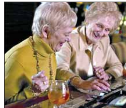
Bet on a great time