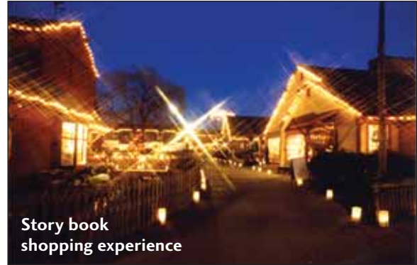
Story book shopping experience

When you depart the casino you'll be whisked away to Olde Mistick Village , a one stop shopping extravaganza unlike any other.