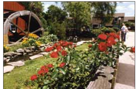
Stroll down flower-lined paths

This delightful complex is a charming recreation of a 1720 colonial New England community. The village sports 60 specialty shops in a yesteryear ambiance with paths, streets, ponds, waterfalls, gazebos, a grist mill and a historic meeting house. Within this giant storybook design lie individual stores each with its own personality. It's a themed shopping adventure uncommon in every way.