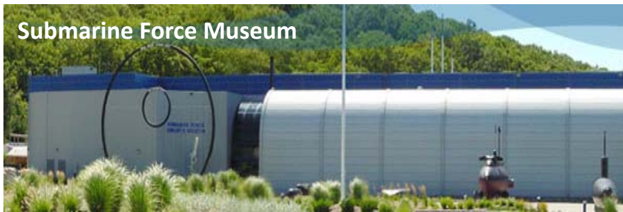
Submarine Force Museum