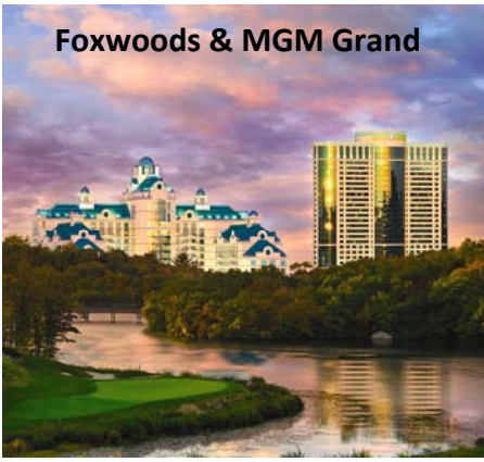
Foxwoods & MGM Grand

At the conclusion of the show you'll step back into your coach and be whisked away to Foxwoods. Foxwoods is one of the largest casinos in the world, with 340,000 square feet of gaming space in a complex that covers 4.7 million square feet. Imagine six casinos under one roof offering more than 7,000 slot machines, 380 tables for 17 different types of table games, 24 restaurants, a luxurious concourse of specialty shops, the Tree House complex, a high-tech Race Book, and the world's largest Bingo Hall.