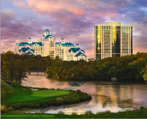
Foxwoods & MGM at Foxwoods