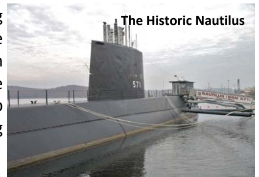
The Historic Nautilus

Aboard the Nautilus you'll experience the first-hand thrill of being a submariner as you walk the decks that made Naval history: the world's first nuclear powered vessel, first ship to go to the North Pole, and first submarine to journey "20,000 Leagues Under the Sea." Explore the spaces where the crew of this amazing ship worked, ate, slept, and entertained themselves on their long voyages far beneath the ocean's waves.